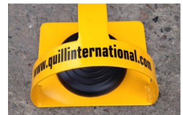
Easy to use foot operated controls