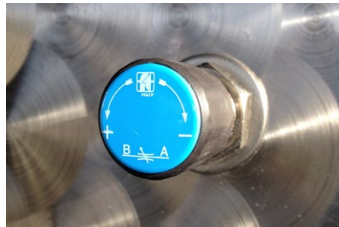
Range of water pressures (0-50bar/725psi) is available to operators through the pressure control valve