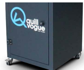
Cabinet containing hot water system provides hot water up to 80 degrees