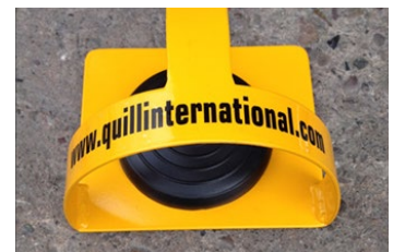
Easy to use foot operated controls