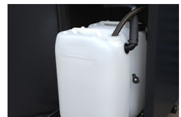
Quill Vogue Wash Station Mobile is a “closed” system containing 2 x 25 litre water tanks making it environmentally friendly