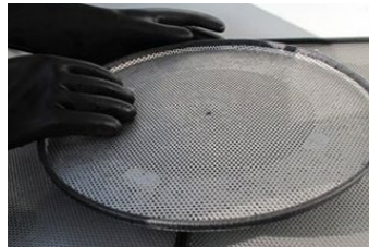
Large wash chamber with rotating turntable for 360 degree cleaning