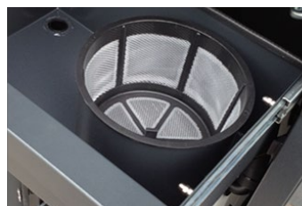
Easy clean filter system recovers solid support material at 3 separate filter stages down to 1mm