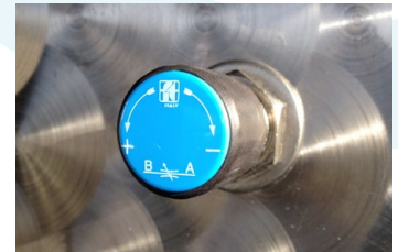
Range of water pressures (0-50bar/725psi) is available to operatives through the pressure control valve