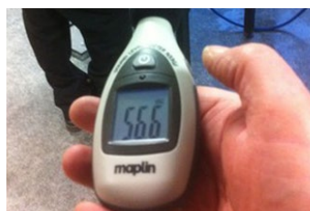
Acoustic foam sound proofing ensures the Quill Vogue Wash Station is as quiet as a normal conversation at only 60dB