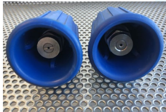
Two jet nozzles. Fan jet for large areas, pencil jet for concentrated precision.