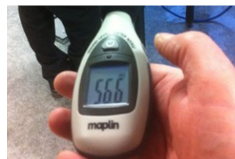
Acoustic foam sound proofing ensures the Quill Vogue Wash Station is as quiet as a normal conversation at only 60dB