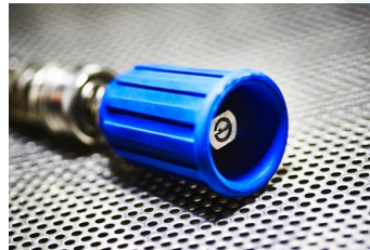
Wide angled fan jet for super-fast support material removal