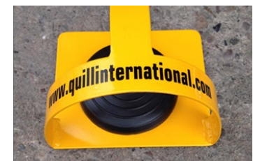
Easy to use foot operated controls