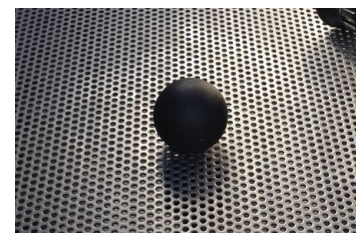
Unique weir filter system prevents support material blockages