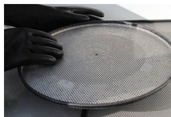
Large wash chamber with rotating turntable for 360 degree cleaning