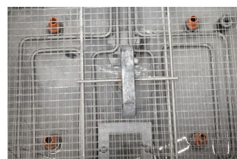
Robust pump for fast, effective agitation of prints