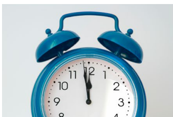
Alarm sounds to alert operators when program has finished