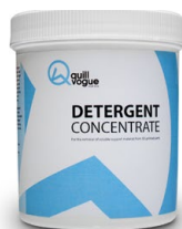
Quill Vogue Soak Box Detergent allows the fast, safe removal of soluble support material