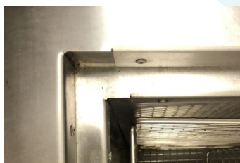
Double skinned and fully insulated to conserve heat and energy