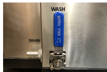
Pump system allows for quick and easy drainage