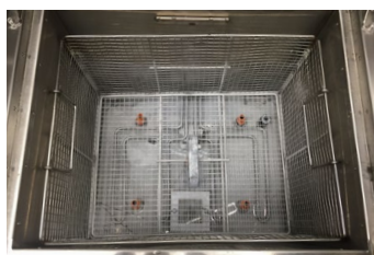
Stainless steel basket for easy removal of parts