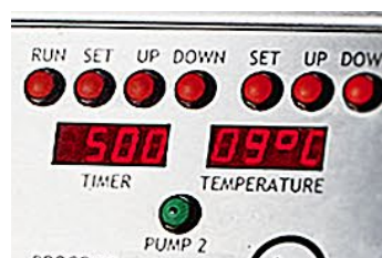
Timer can be programmed to run for up to one week and temperature can be set up to 99°C